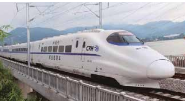
CRH Train (Plumbing)